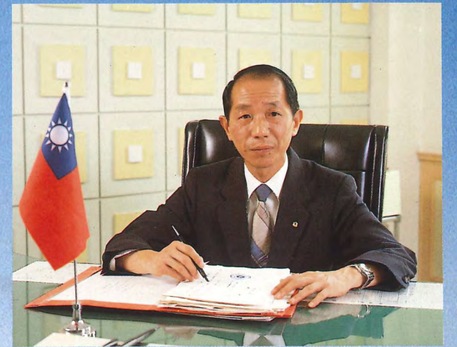
基隆市長 Mayor Chung-Shi Chang

In terms of municipal works, it is a marketing career. Also, any construction must depend on popular sentiments. On base of pre-statement, Keelung city construction will come to an new-era by "The Municipal Construction for Raiseing Keelung", matching with the objects of mid-long term and for-seeing objects. In this, we hope our citizen to gather our power, join municipal construction, and to construction Keelung to be clean beautiful modern and humanity harbor, contributing one of our effects.